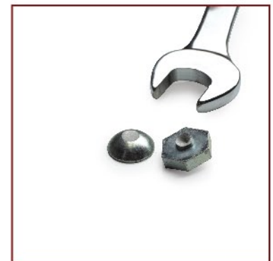
3 Hex part shears off at set torque to leave a smooth permanent flush