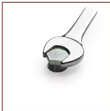
2 Tighten using standard spanner